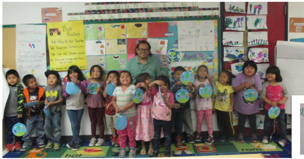
EPO staff with Head Start Classroom #104 making earth day signs.

I pledge to use my reusable bags at the store. I pledge to teach my lil guy to use the potty to reduce the use of pampers - & fatten my pocket. Bpusher